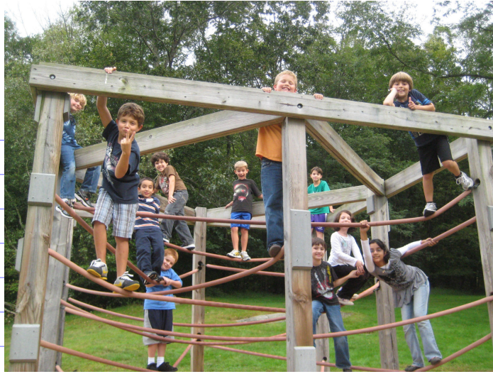
Katonah kids hanging around!

Although the kids of Katonah were sad to see the summer end, they were more excited for school to start and to spend time with their friends at CCC! They picked up right where they left off in June making the transition from summer effortless. Everyone dove back into the routine of