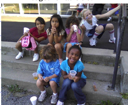
Enjoying a yummy afternoon snack!