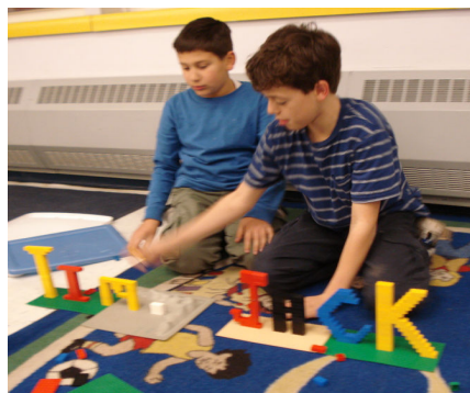
Some of the Lego city planners at LES hard at work!

and art ideas for this multi-talented and multi-interested bunch! Other options for indoor activities include painting, beading, lanyard crafts, board games and sports in the gym. Let's not forget our Lego fanat-