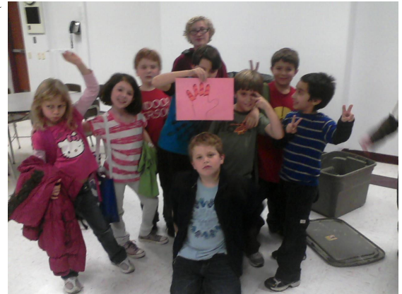
KES kids posing with a new feathered friend!

may celebrate in a different way, one thing the kids had in common was their excitement for the Thanksgiving meal! Yum!