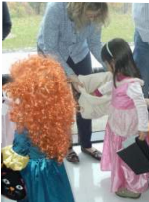
Right: Trick or treating fun!

Every year since Kitchawan has opened the pre-K has joined their pre-k friends from our Watson location to visit IBM for some Halloween fun. We are very lucky as a center to have such a great relationship with IBM.