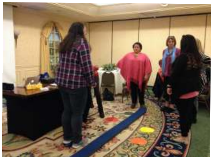
Below: Creating a movement activity.