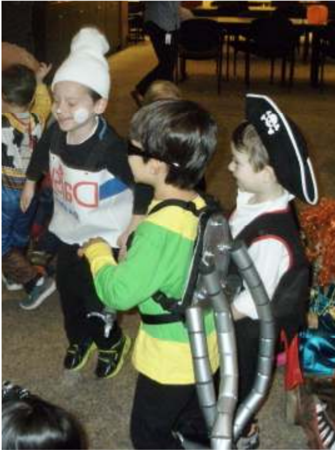
Above: The children dance and sing at IBM.