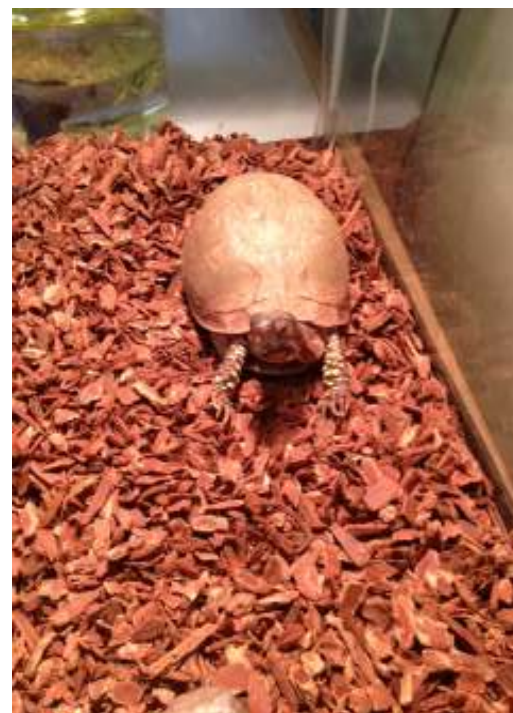
Right: Tank the Turtle.