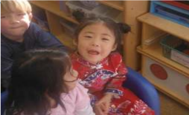
Making fried rice with the Pre-K class.

We are grateful to the parents who have come to share time with us. A mother, new to our program, asked if she could come and spend some time in the classroom as she is not involved with her child's drop off or pick up. A nice idea I thought. And that it was. A good time was had by all. I believe she came away with an appreciation for what the teachers do and she got a bird's eye view of how her daughter spends her day. We had another parent volunteer to come in and cook fried rice. That day his daughter dressed up in authentic clothing and had her hair done in a way she usually doesn't wear it. It was special for the child, her classmates, and for her dad!