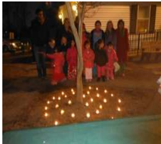
Above: Diwali celebrations Below: Chanukah celebrations