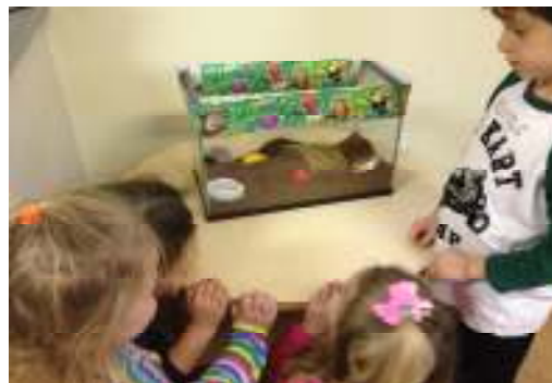
Pre-K children saying hello to Spidey crab!