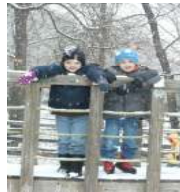
Left: Pre-K playing in the snow!