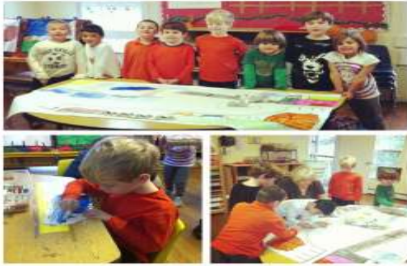
CCCK children are proud of their hard work!

It was a great start to the school year for the Pre-K and CCCK classes with just a bump in the road during all the crazy after-effects from hurricane Sandy but both programs have settled back into their usual routines. The Pre-K class has enjoyed many wonderful curriculum activities thus far including making awesome superhero capes for the "post Halloween" celebration and enjoying the Sharing Feast. Their new topic is "Animals in Winter" with a focus on hibernation, migration and adaptation. The class adopted "Chippy" the chipmunk (a beanie baby!) in the dramatic play area and even made him an amazing nest to curl up in. They also had fun pretending to be chipmunks living underground in nests and tunnels. Miss Jessica read the story THE NIGHT TREE by Eve Bunting and the class is currently involved in collecting all sorts of edible snacks to string together so they can decorate a Pre-K class 'Night Tree' for all the animals at the White House to enjoy.