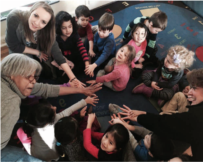
Above: Diversity at hand in the Preschool

Writing this spring's Centerpiece brings back fond memories of past years with the CCC. I can recall returning as site director of Bedford Hills, with the desire to share in writing what incredible diversity we have at our location. Exposure to the beauty of various cultures can have a profound impact on children. Hopefully the experience helps raise global citizens accepting of differences. The theme for my article then, as it is now, is "Around the World".