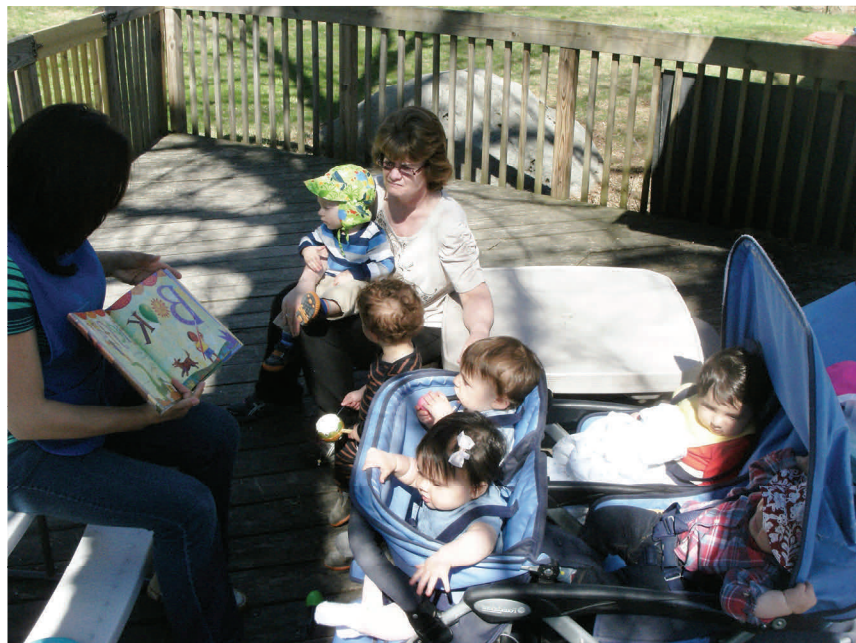
Infants enjoying reading stories outside