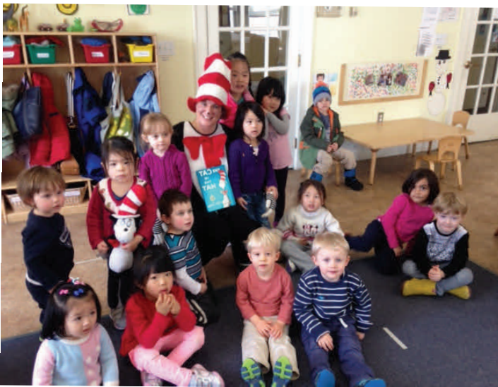
Below: The Toddler children with the Cat in the Hat !

Life with children can be creative and more meaningful when we celebrate the small things. Celebrations bring the feeling of excitement to life, especially in children. Here at Watson, the building came alive with the sounds of children laughing as we celebrated several events throughout late winter and into early spring.