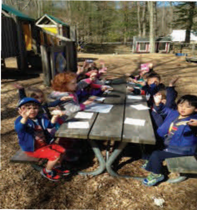
Above: The Pre-K children enjoying their princess pizza

After a long winter, we are happy to see the sun has made its way through to bring us the warm weather we've been waiting for. That brings a smile to the faces of many, especially the children!