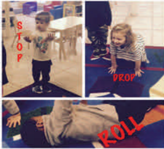
Above: Preschool children practicing fire safety.