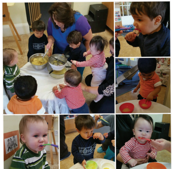
Below: Infants making and tasting apple sauce