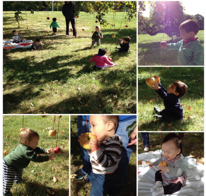
Above: Infants picking apples with their teachers.