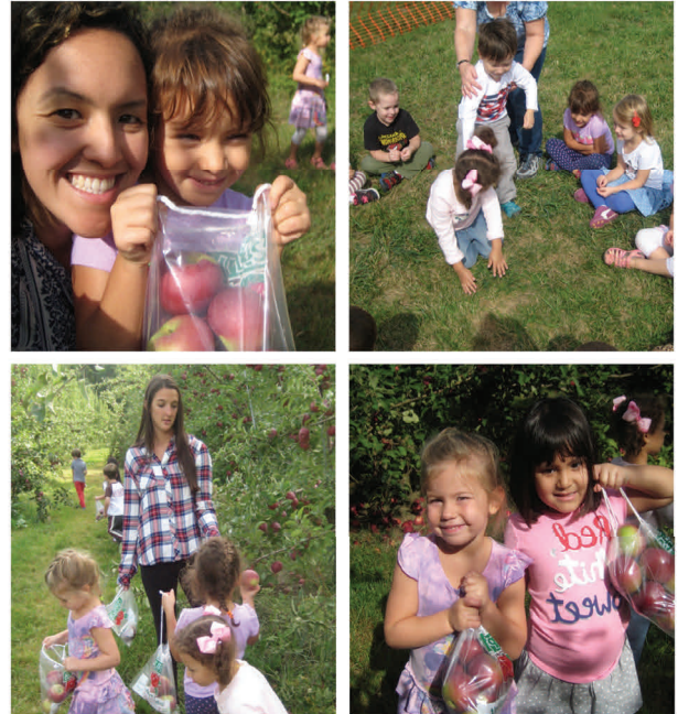
Above: Pre-K classes enjoying their trip to Wilkens Farm