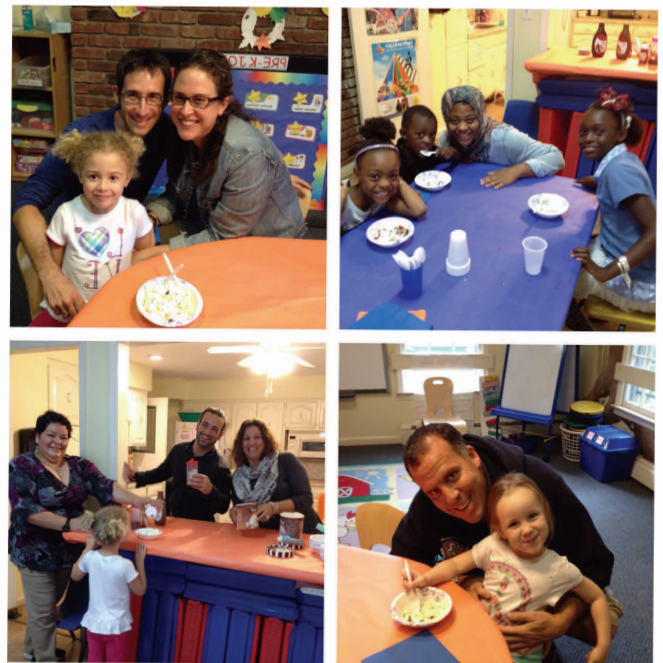
Below: Families enjoying the ice cream social.