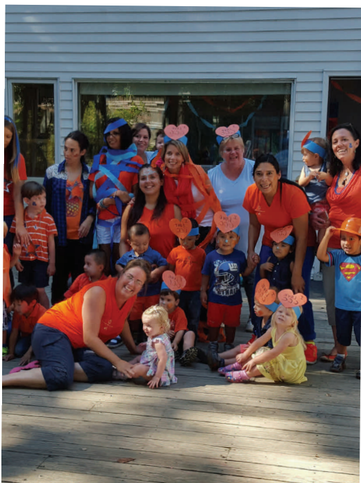
Below: CCC Bedford Hills Staff celebrating CCC spirit!