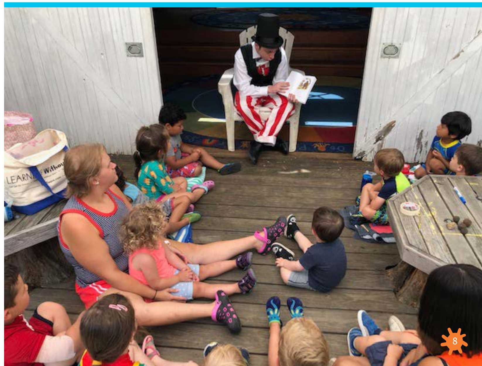
On the right: Students and activities at Bedford Hills.