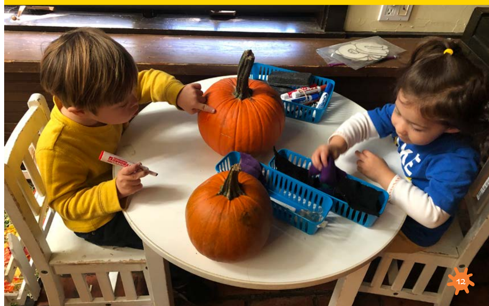
On the right: Students and pumpkin painting at Kitchawan. On the top right: It's time for some bubble fun!