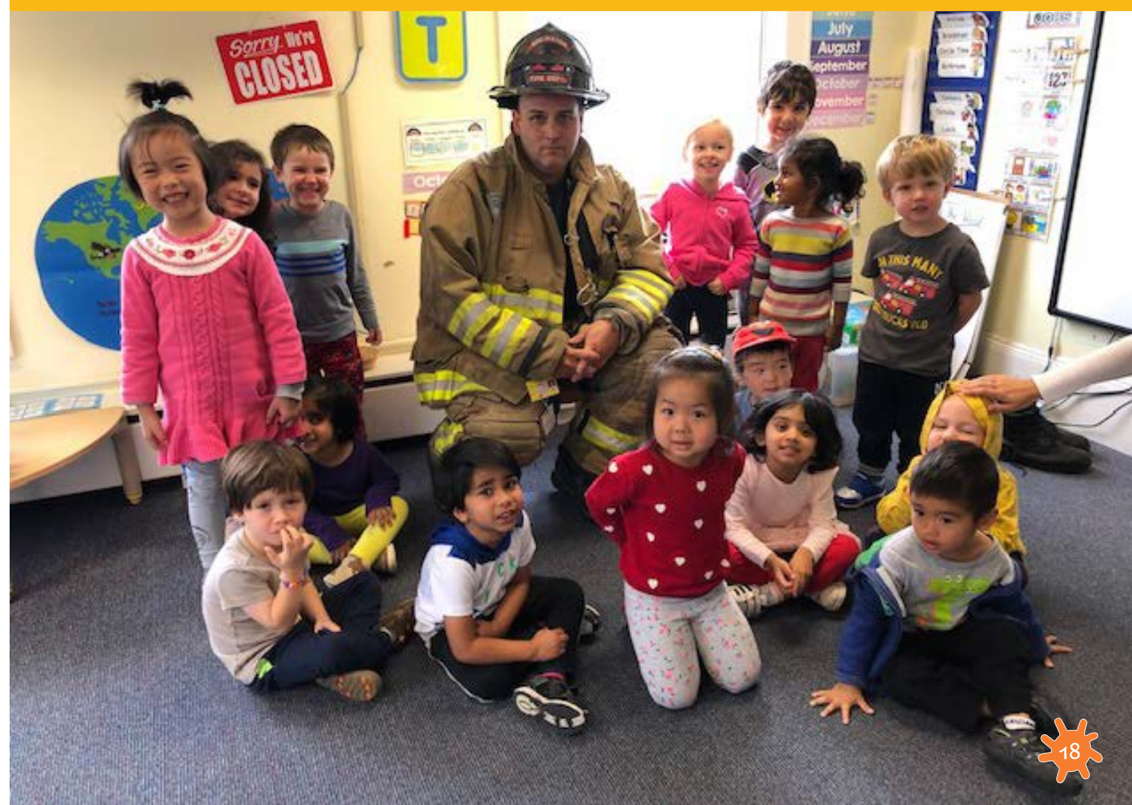
On the right: Some of the wonderful students from Watson during their Firefighter visit.