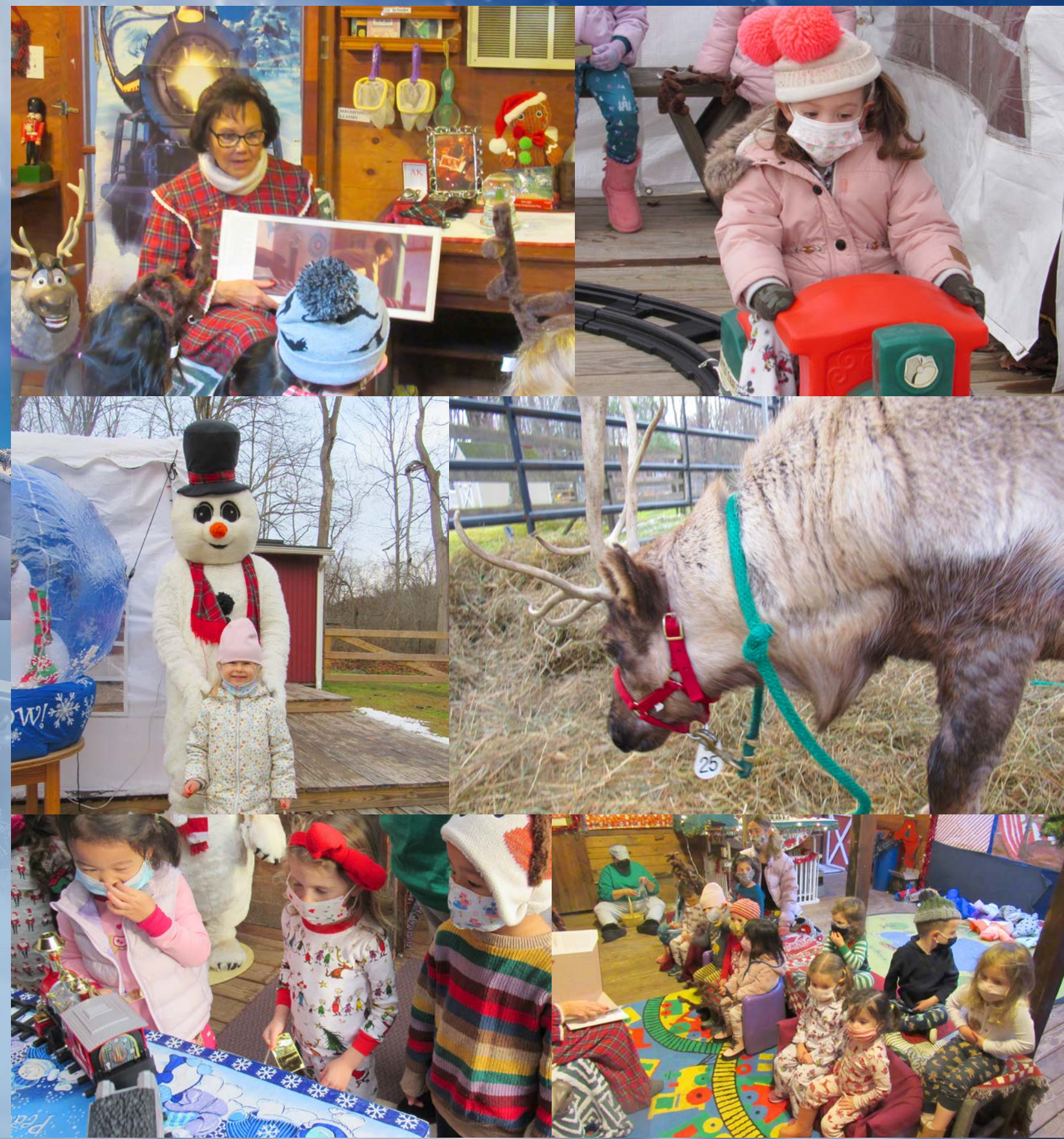
On the right: CCC students at the Polar Express event.

The CCC is glad to bring this joy and magic to children during this time of year!