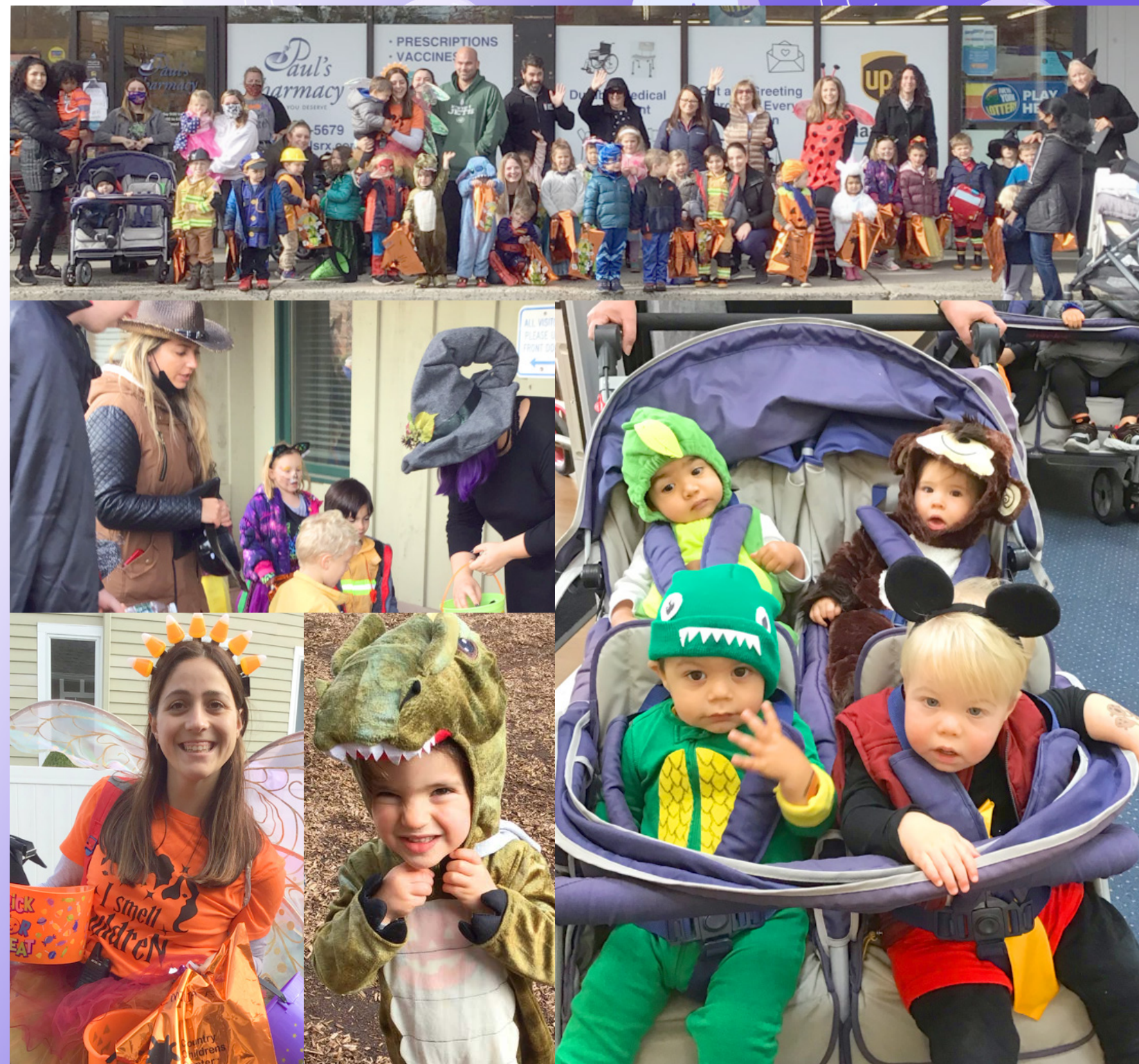
On the right: Students and activities at Oak Ridge.

As always, the families in our center came together to make the day special for each child. Donations of candy and small toys were made, allowing us to fill the bowls that we went on to hand out to each business. On October 29th, the day of our parade, so many parents and grandparents took the time to celebrate and lend a helpful hand as we gathered all the children to start the parade. Our entire center lined up to show off their costumes as we walked together to each stop. It was wonderful to see the group of almost fifty people making their way through the shopping center. We feel lucky to share the joy in these moments with the children in our center while also being able to involve the community at the same time!