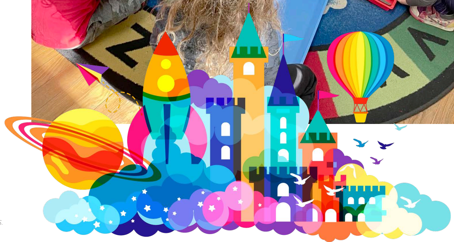
On the right: Students and activities at Bedford Hills.