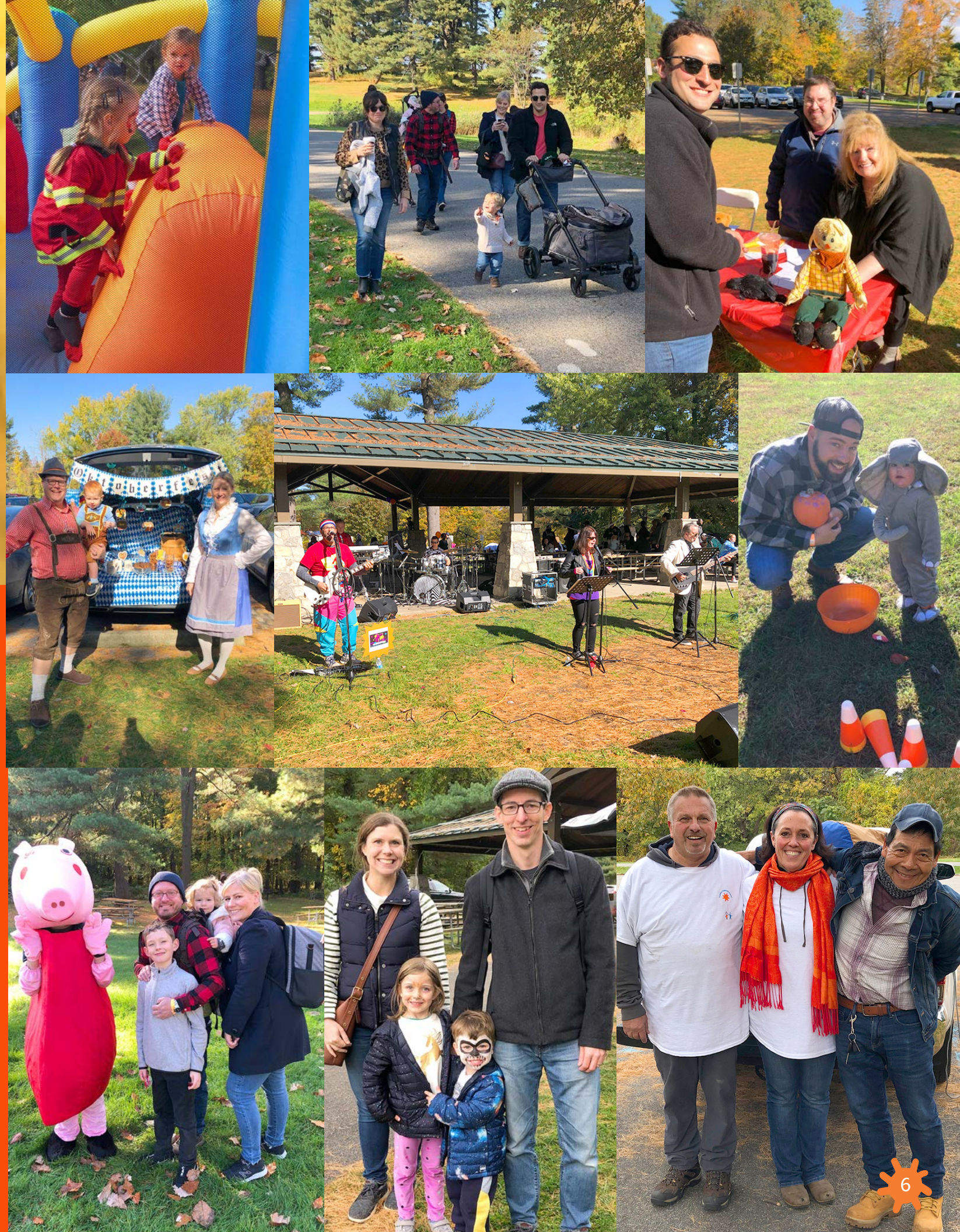
On the right: CCC families at the 2021 Fall Fest-a-thon.