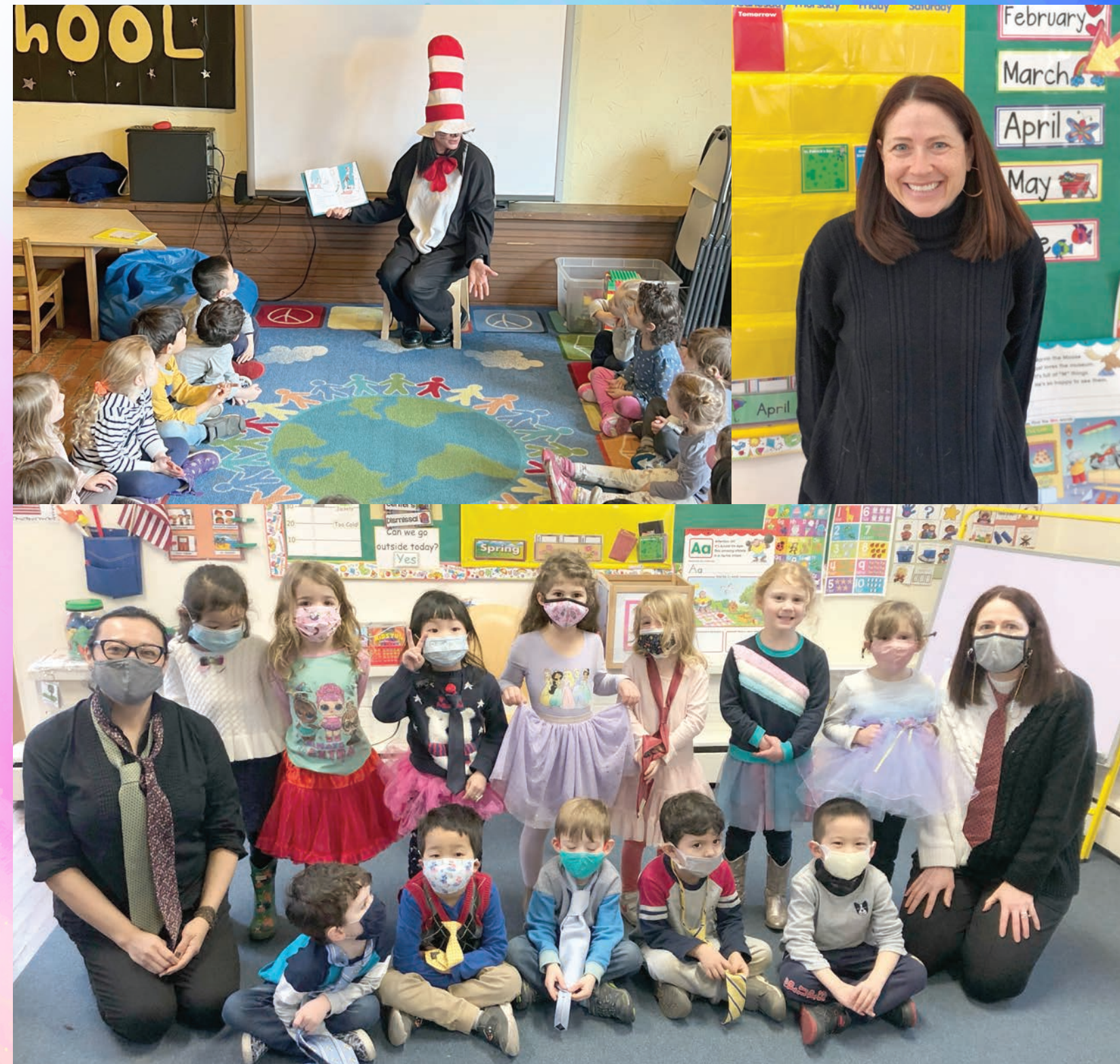
On the right: Students and activities at Kitchawan.